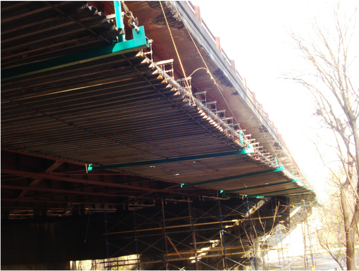
Platform Tie Ups & Tube & Hanger Supports

PROJECT DESCRIPTION: Concrete Deck Removal & Blasting & Painting Project