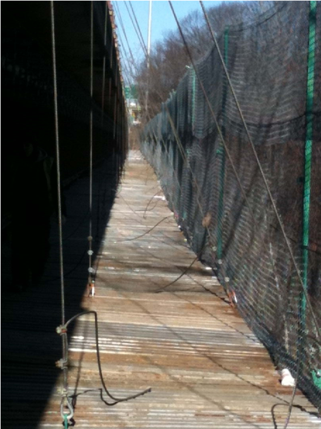
Perimeter Protection & Debris Netting