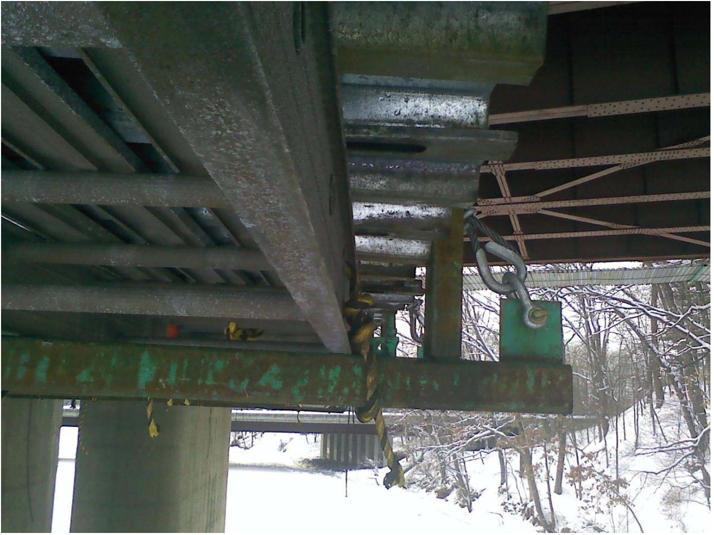
Tube & Hanger/Staging Supported Metal Deck Platform Around Piers