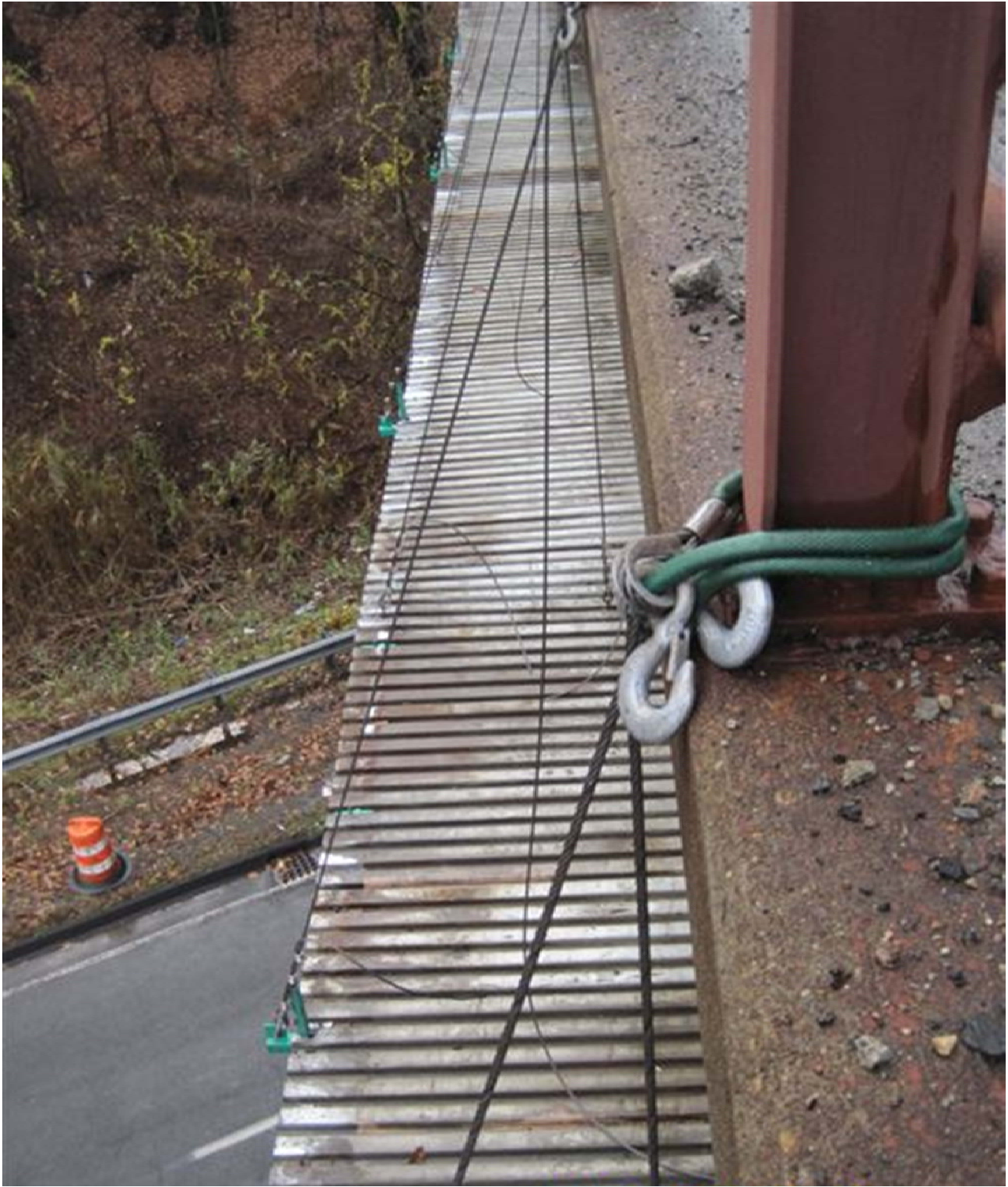
Platform Tie Ups & Tube & Hanger Supports