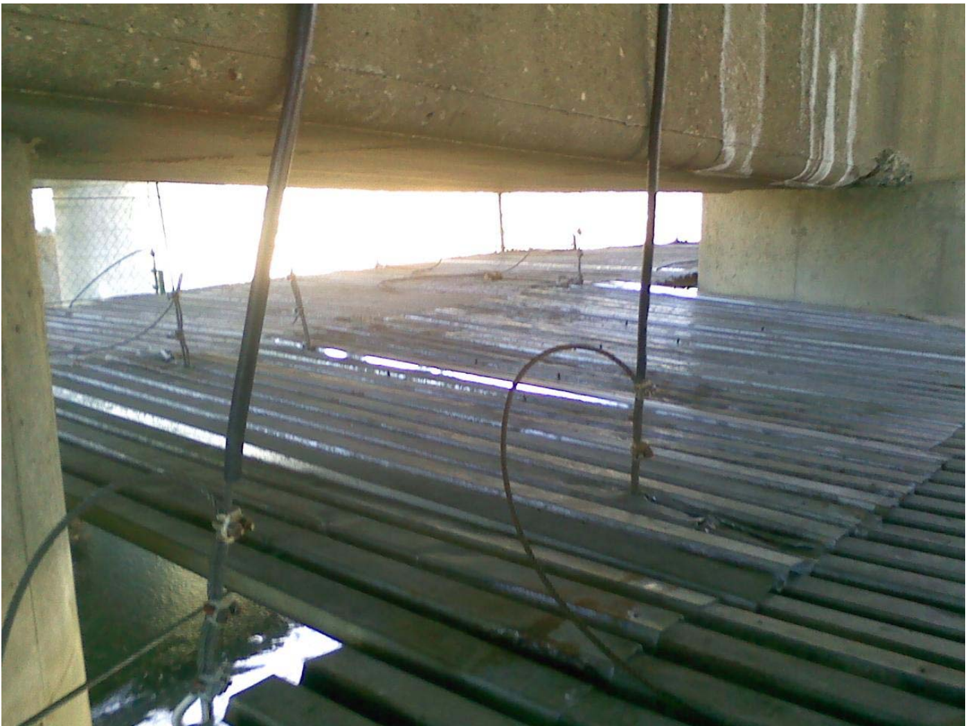
Tube & Hanger/Staging Supported Metal Deck Platform Around Piers